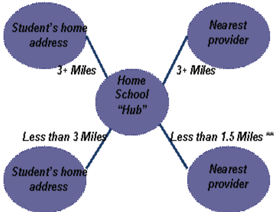
Figure 2 Concessionary Travel Journey Criteria Model B

** If this journey is greater than 1.5 miles then transport would be provided on the grounds that it is not a reasonable journey time.